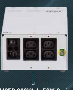
REMOED 300VA A-50W Series Isolation Transformer