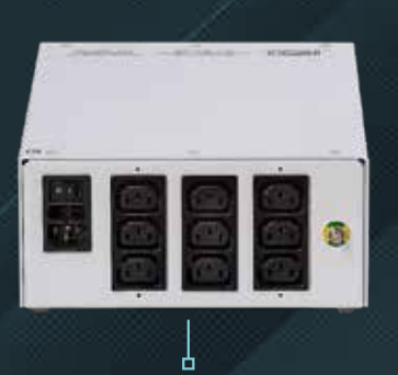
REMOED 1000VA A-50W Series Isolation Transformer