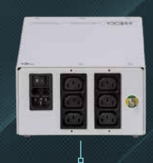
REMOED 600VA A-50W Series Isolation Transformer